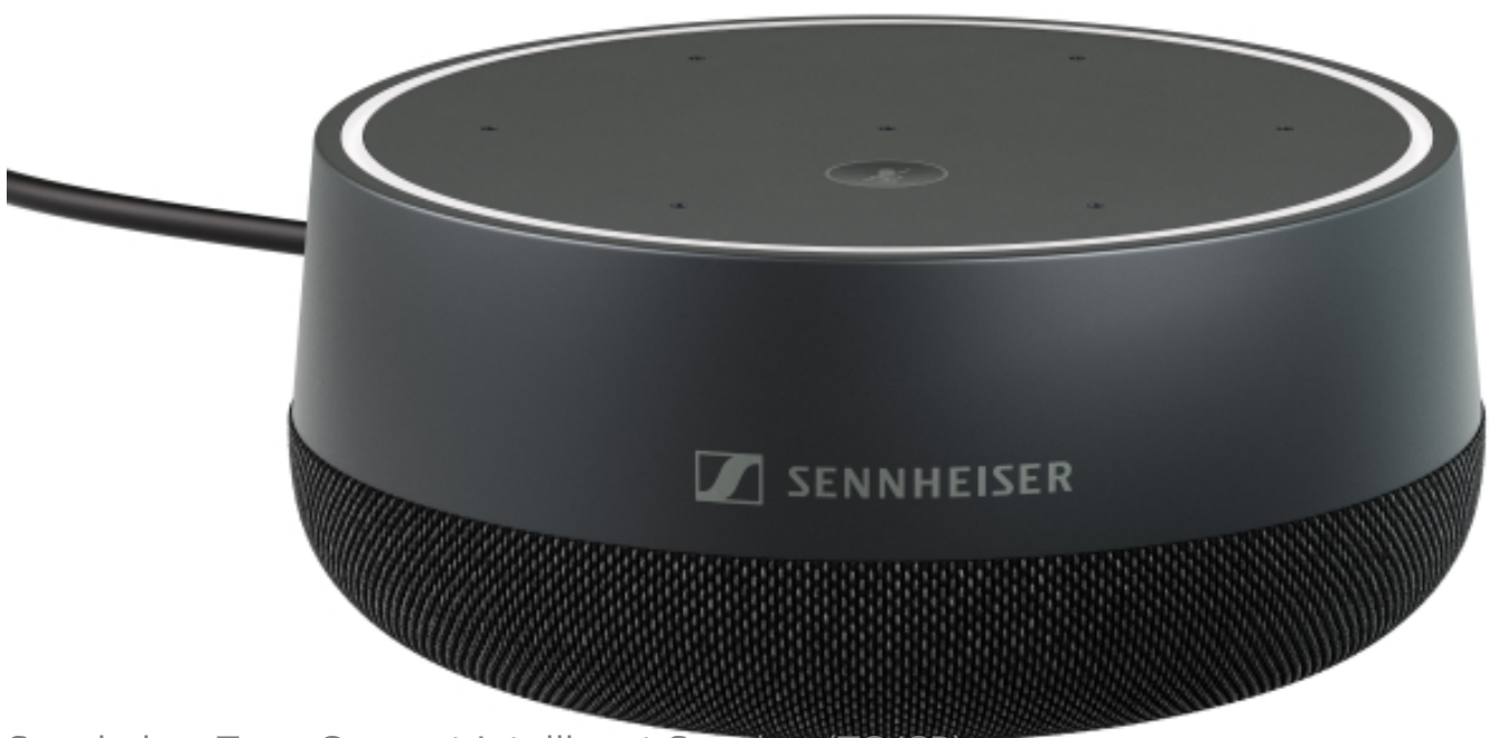
Sennheiser TeamConnect Intelligent Speaker (TC ISP)

Coming off the heels of a strong showing at Integrated Systems Europe in Barcelona, the Sennheiser TeamConnect Intelligent Speaker (TC ISP) will once again be on display, this time at InfoComm. Launched earlier this year, this new addition to the TeamConnect family is certified and optimized for the Microsoft Teams Rooms. Attendees will see the first intelligent speaker from Sennheiser on display at booth W957.