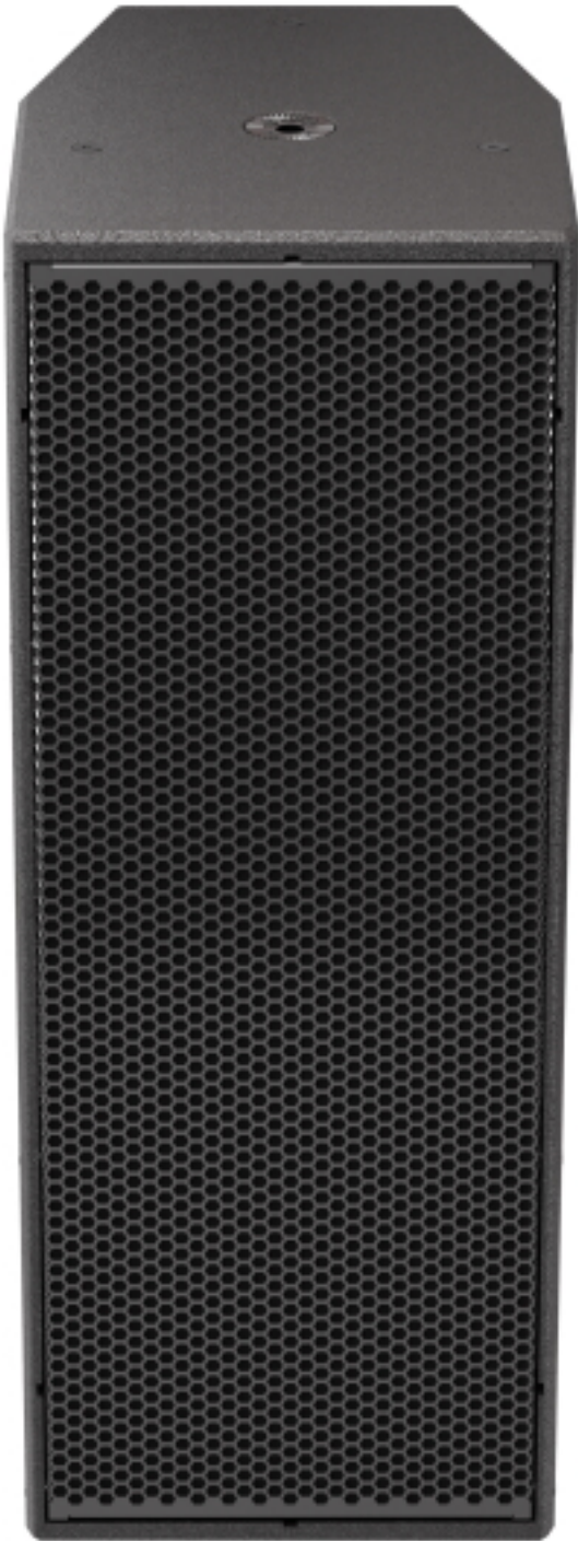
dBTechnologies IS 210L

Equipped with the same transducers as the IS 210L, and also in a symmetrical configuration, the IS210T point-source loudspeaker has a 90x40 rotatable horn. Using the same accessories available with the ViO X310, the IS210T sound reinforcement is adaptable to flyable or pole-mount installations, making it suited for a variety of applications. The line and point source are available in two colors: black and white. On the white version, the color finish is customizable.